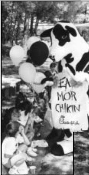
Children enjoying the "Fun From Books" carnival at the college's Decatur Campus.

Calhoun's AmeriCorps program is one of several different programs in which the College is involved as part of the America's Promise program, coordinated by Gen. Colin Powell.