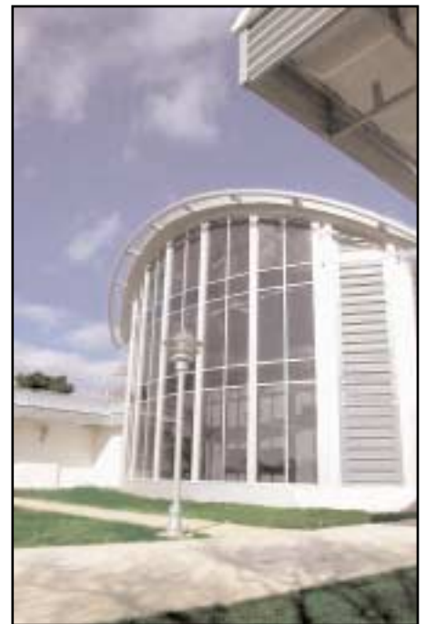
Advanced Manufacturing Processes Lab

All classes in the new program will be taught in Calhoun's recently completed Advanced Manufacturing Processes Lab, Phase II of the College's Aerospace and Advanced Technology Park. Anyone interested in learning more about the Advanced Electronics Manufacturing program should call 256/306-2666.