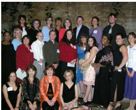
2005 SKD Convention Delegation